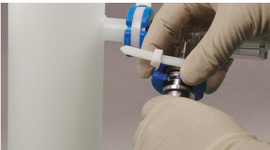
Insert cable tie end and slide clamp closed