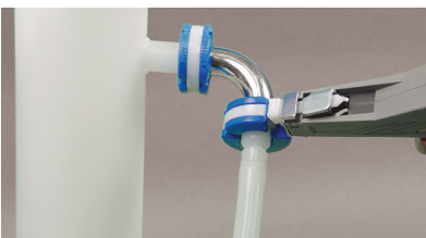
Finish closure by using SaniSure installation gun to calibrated tension